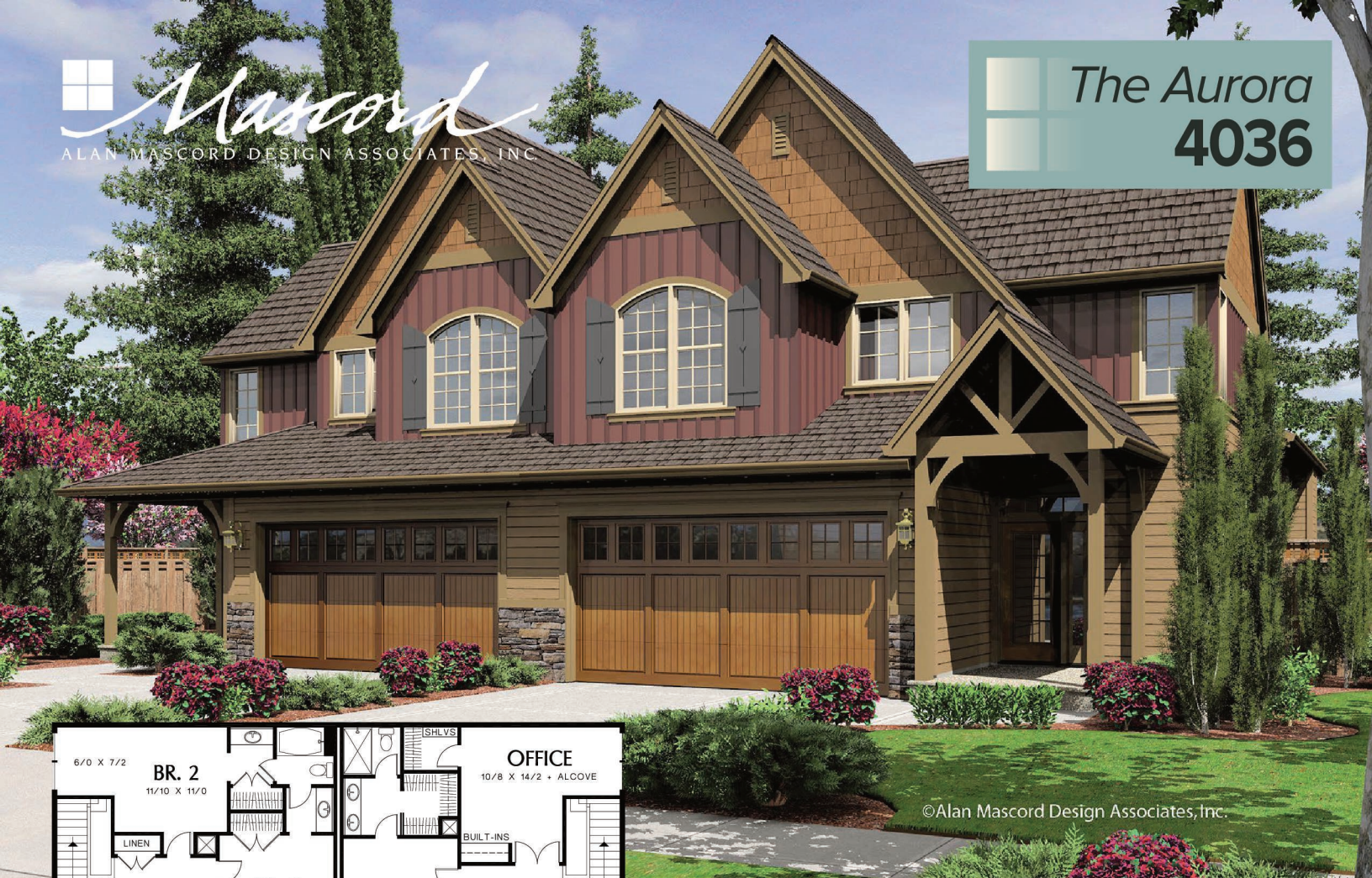
©Alan Mascord Design Associates, Inc.